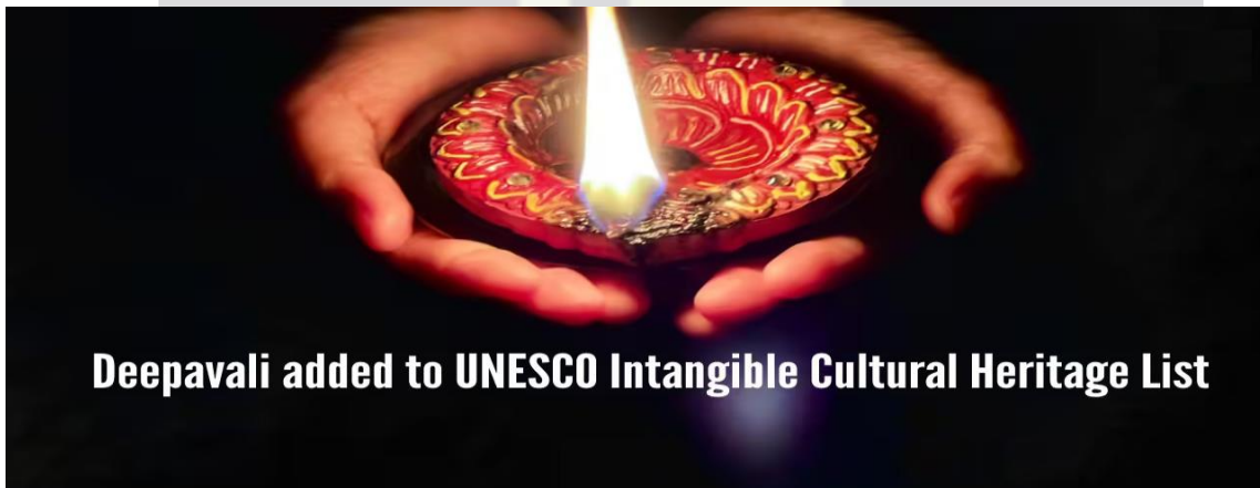
Deepavali added to UNESCO Intangible Cultural Heritage List