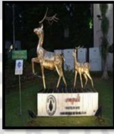
Waste to Art, CMPDI