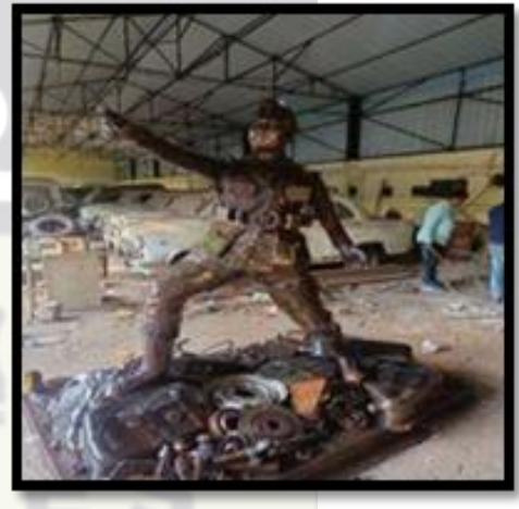
Waste to Art, BCCL