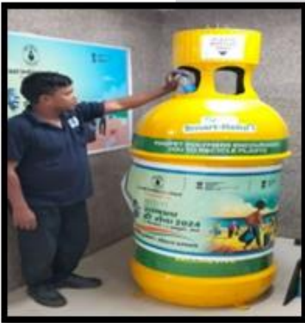
AI Bins, CIL